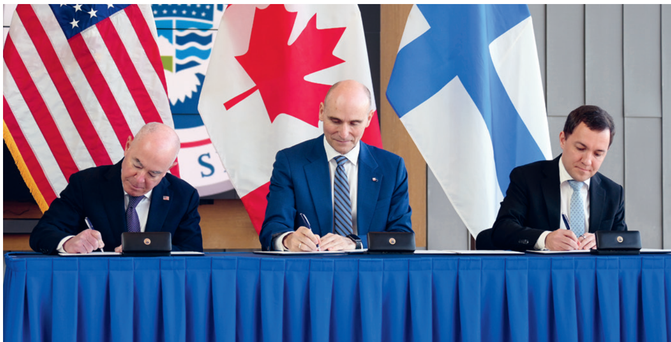
EMBASSY OF FINLAND IN WASHINGTON DC