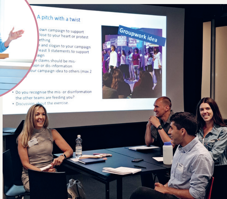
“STOP, THINK, CHECK with Future Voters” workshop equipped Fulbright-Hays educators with activities and strategies for tackling digital literacy with their students.

www.fulbright.fi/about-us/blog/under-midnight-sun-transformative-lessons-finnish-wilderness-lapland