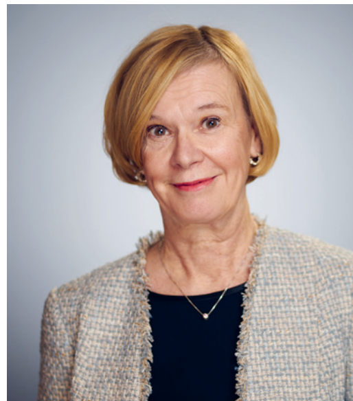
MINISTRY FOR FOREIGN AFFAIRS

“From environmental sustainability to health, from quantum technologies to Arctic innovations, our countries can deliver solutions, often through advanced science and critical technologies.”