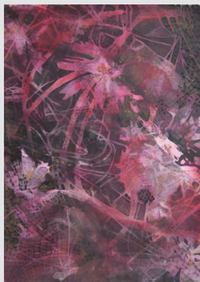
Re:Peat: Layer 18x24", ink, gouache, watercolor, conte, graphite on paper

Read more about the exhibition: https://mabd.fi/hayttely/anne-yoncha-repeat https://anneyoncha.com