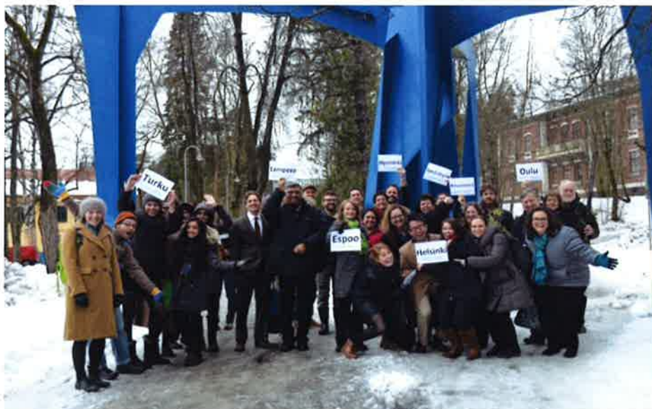
Figure 5: U.S. Fulbright grantees at the “Fulbright Forum: Education, Innovation, Science and Art” at the University of Jyväskylä

The Fulbright Finland Foundation supports the internationalization of education and research in Finland, and helps U.S. and Finnish institutions create linkages. Under its Internationalization Services the Foundation organizes study tours to the U.S. for Finnish higher education experts; runs the Fulbright Speaker Program , the Fulbright Dialogues series, and the Transatlantic Roundtables series for tackling issues related to transatlantic higher education cooperation, and organizes two major public Fulbright Seminars annually.