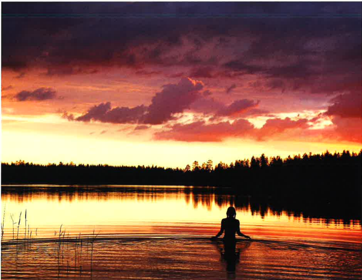
Figure 8: Midnight Sun in Finnish Summer (Harri Tarvainen/Visit Finland)