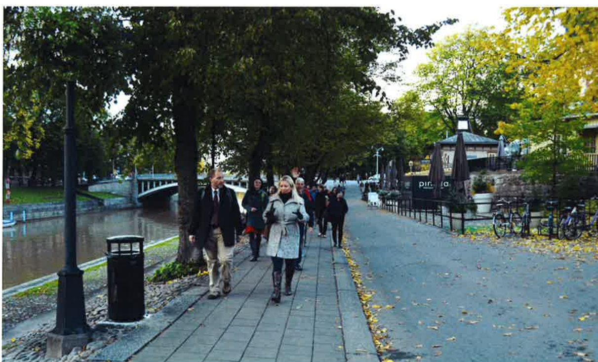
Figure 3: U.S. Fulbright grantees in Turku, Finland for the annual American Voices Seminar

Finland is an ideal destination for international students as many of its classes are delivered in English; its programs rank highly in terms of educational quality; and its institutions offer services that support students during their stay in Finland.