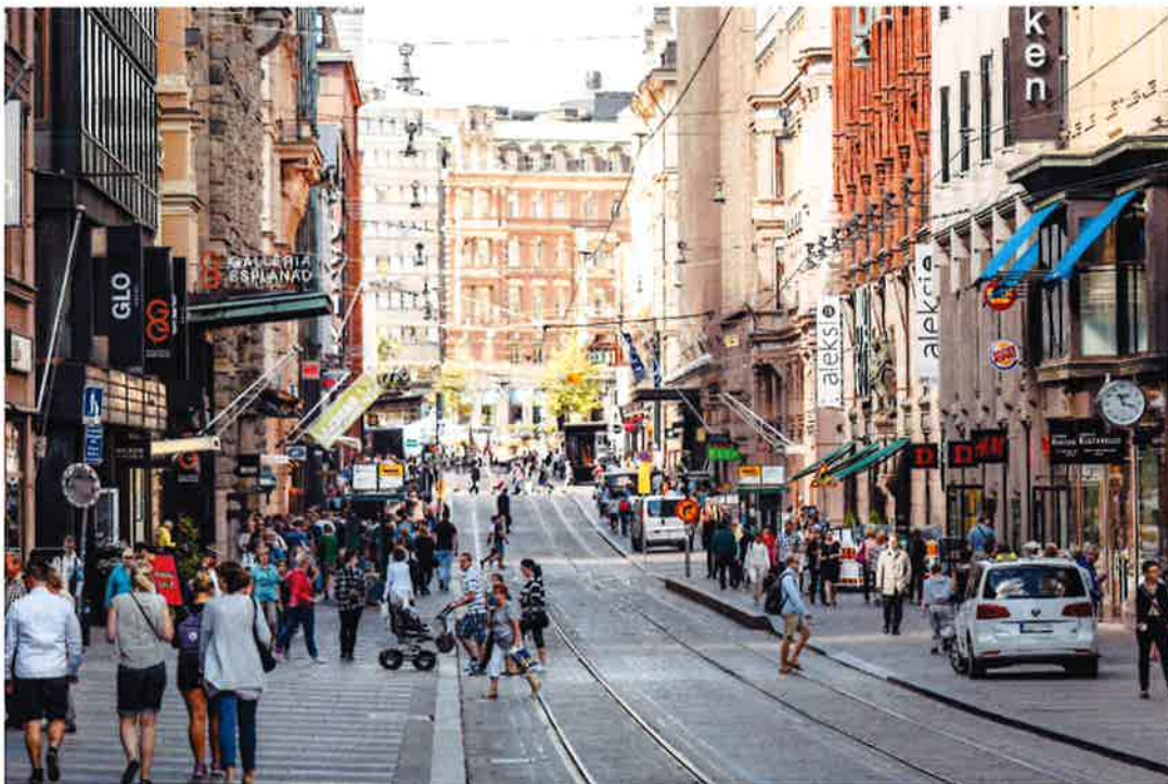
Figure 6: Helsinki City Street

A key strength of the Foundation is the consistent strategic engagement of the alumni: 5,500 Finns and Americans have received a grant from the bilateral program since its inception in 1949 and the Fulbright Finland Foundation runs an active and rapidly growing alumni network in both countries.