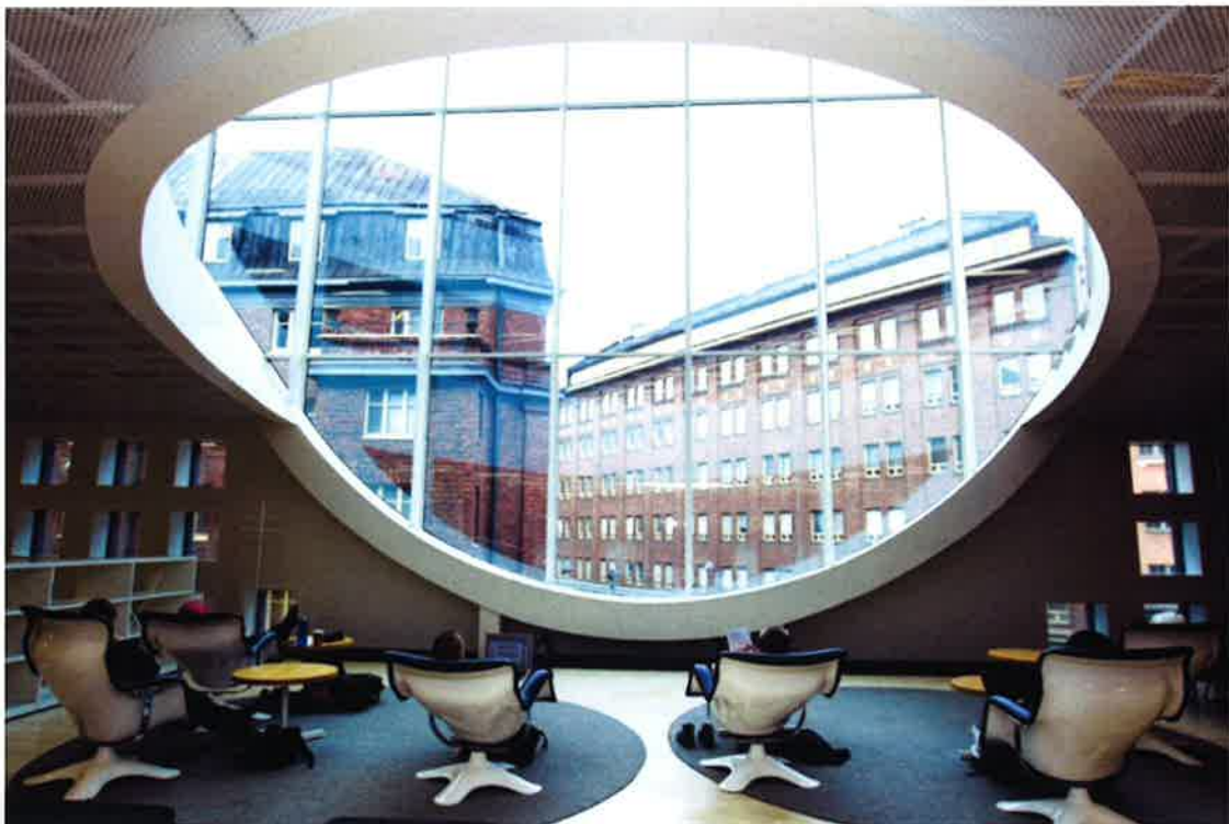
Figure 4: Students at the University of Helsinki Library

The professors that guide students are approachable experts in their fields.