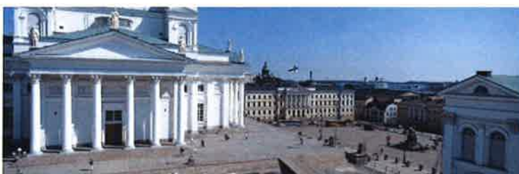
Figure 1: Helsinki Cathedral

The Finnish National Agency for Education (EDUFI), the Fulbright Finland Foundation and IIE have authored this paper to inform Americans interested in new international partners about opportunities we offer to explore one of the greatest nations in the world, Finland. Tervetuloa!