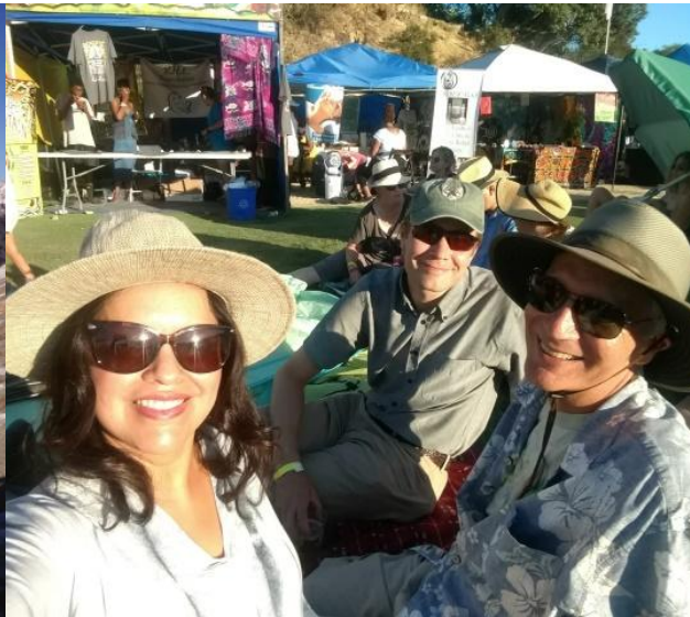
Reggae Concert in Topanga Canyon, CA