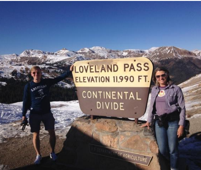
Hiking in Colorado

New connections and unique experiences with other grantees and Fulbright Finland alumni in the U.S.