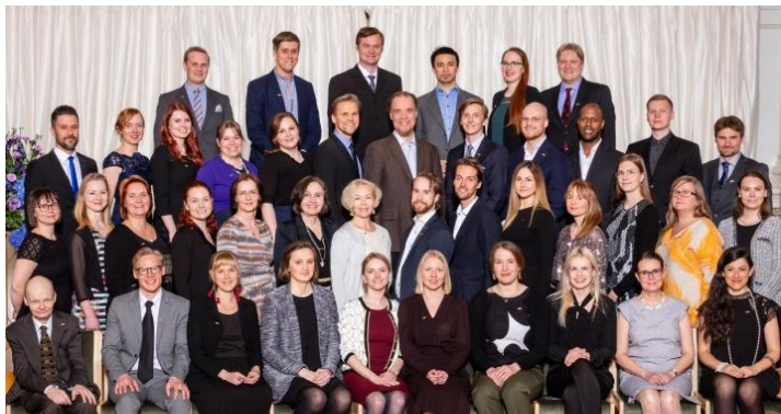
Grant Programs (approximately 90 grantees per year)