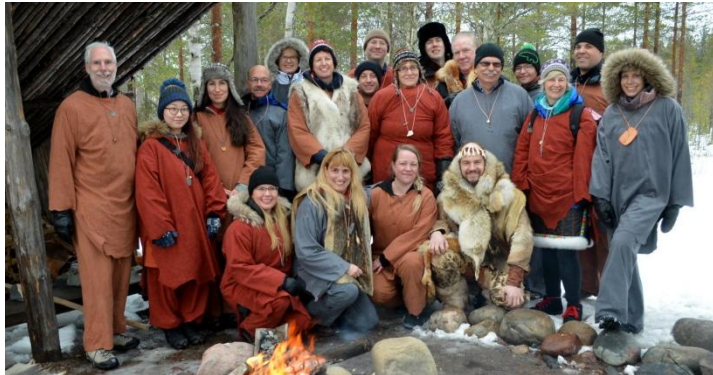
Cultural Exchange Between Finland and North America