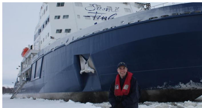
Cultural Ambassadors and Change Makers