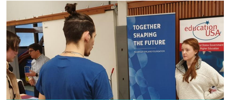
Advising, Training and Information Services for Students, Researchers, and Working Professionals