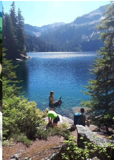
Hiking in Seattle area