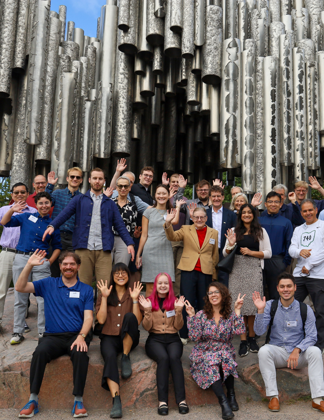
2022-23 GRANTEES AT THE AUGUST ARRIVAL ORIENTATION