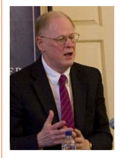
James Duderstadt speaking during Session I.

evidence that qualified young people from families of modest means are far less likely to go to college than their affluent peers with similar qualifications. America's higher-education financing system is increasingly dysfunctional. Government subsidies are declining; tuition is rising; and cost per student is increasing faster than inflation or family income." (Miller, 2006) Furthermore,